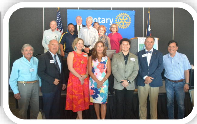
2023/ 2024 Rotary Board of Directors