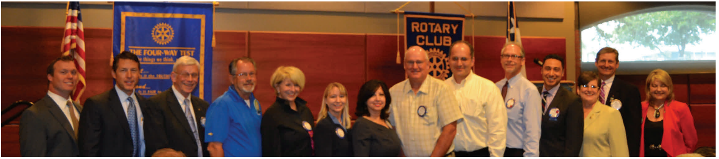
2014-2015 Board of Directors